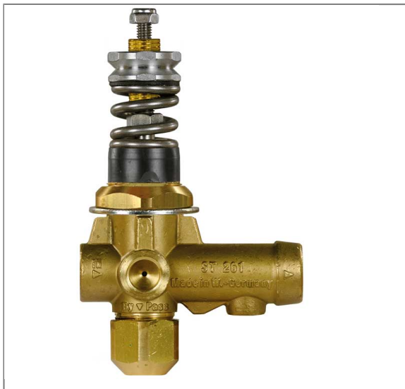
Vanne bypass Suttner ST-261

pour montage en saillie sans molette de réglage