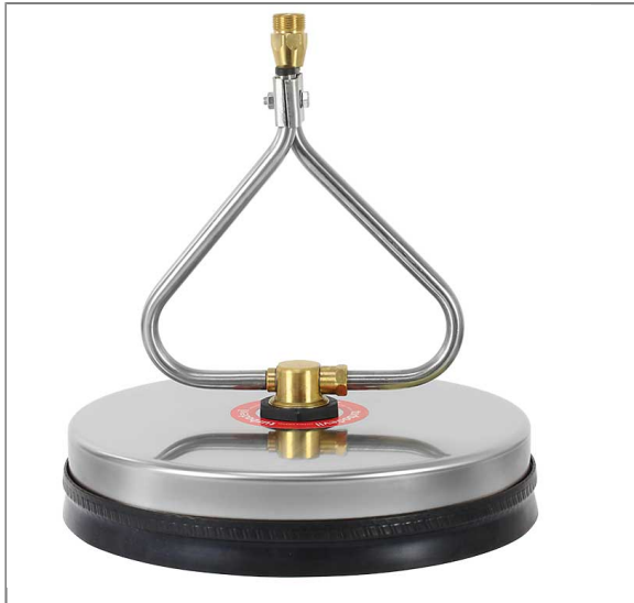
Wall cleaner WW 301