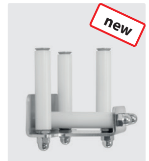
ST-71. Hose guide as wall bracket for hoses up to 38 mm outside diameter

Very stable and rust-free: 2 holes are provided for wall mounting.