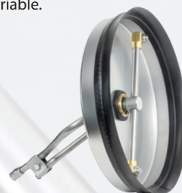
low vibration: balanced rotor arm in a robust quality.