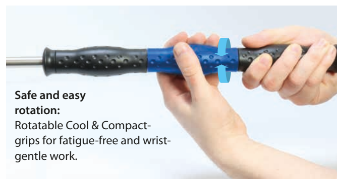
Safe and easy rotation: Rotatable Cool & Compact-grips for fatigue-free and wrist-gentle work.