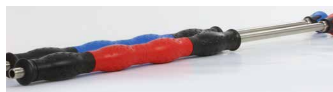
In good shape: Colours for different applications