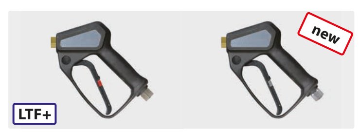
Professional gun. Patented valve kit. Especially wear-resistant ball made out of carbide. Max. 400 bar / 35 l/min / 150 °C