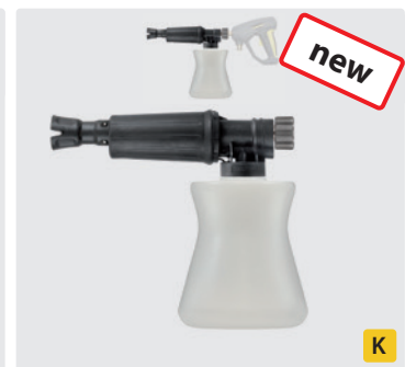
TR20 F. Stainless steel. Foam injector lance with regulator and bottle. Max. 300 bar / 80 °C