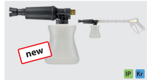
M22 M. Foam injector lance with regulator and bottle. Max. 300 bar / 80 °C