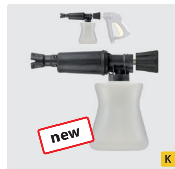
M22 F swivel. Foam injector lance with regulator and bottle. Max. 300 bar / 80 °C