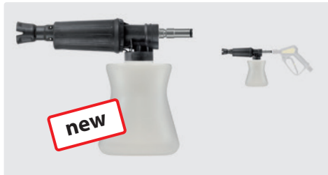
ST-247. Foam injector lance with regulator and bottle. Max. 300 bar / 80 °C