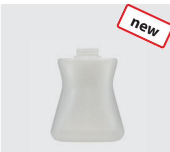
Replacement bottle 1 liter for ST-73.1 and ST-73.2