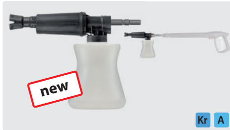
Plug KW. Foam injector lance with regulator and bottle. Max. 300 bar / 80 °C