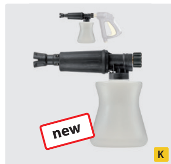
M22 F. Foam injector lance with regulator and bottle. Max. 300 bar / 80 °C