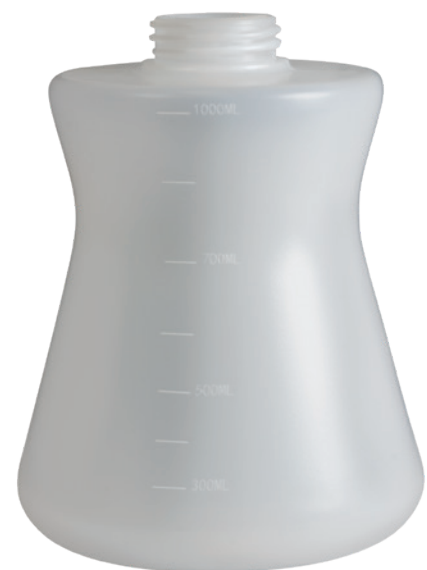
New 1-liter bottle with scale: Fill level can be read.