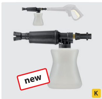
Bayonet K. Plastic. Foam injector lance with regulator and bottle. Max. 180 bar / 80 °C