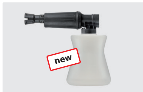
1/4" F. Foam injector lance with regulator and bottle. Max. 300 bar / 80 °C