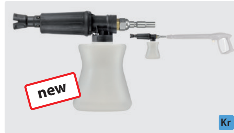
Plug KR. Foam injector lance with regulator and bottle. Max. 300 bar / 80 °C