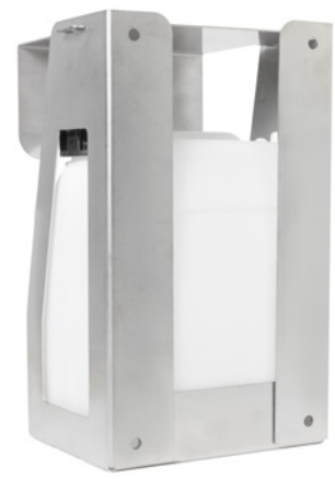
Wall mounting: There are four mounting holes for easy installation, ø 8.5 mm.