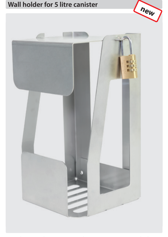
Stainless steel. Two-part with cover. 4 mounting holes for wall mounting, \emptyset 8.5 mm. Delivery without lock. H/W/D = 320/198/180 mm. 2 kg