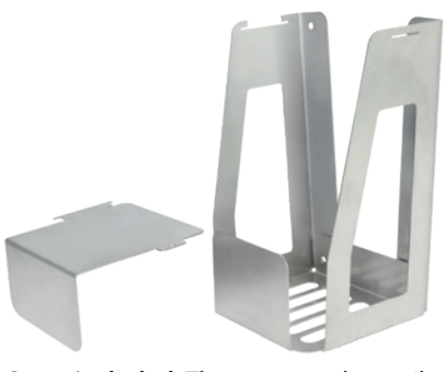
Cover included: The cover can be easily pushed in to store the canister.